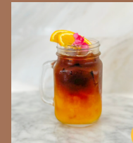
Iced Orange Americano Fresh orange juice and freshly brewed coffee อเมริกาโน่ส้มเย็น