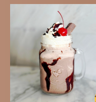
Walk to Mars Milkshake Chocolate ice cream, hazelnut, whipped cream, Mars, chocolate and caramel ช็อกโกแลตมาร์