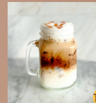
Iced Caramel Macchiato Freshly brewed coffee, milk and caramel คาราเมลมัทคิอาโต้เย็น