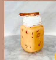
Famous Iced Thai Tea Thai tea, condensed milk and fresh milk ชาไทย