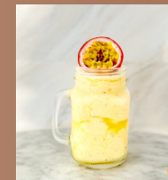
Mango & Passion Smoothie Fresh mango and passionfruit blend มังงูและเสาวรสปั่น