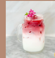
Milky Rose Iced Tea Rose flower iced tea with milk ชานมกุหลาบ