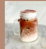
Iced Chocolate Mocha Freshly brewed coffee, milk and chocolate มอคค่าช็อกโกแลตเย็น