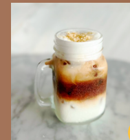
Iced Vanilla Macchiato Freshly brewed coffee, milk and vanilla วานิลลามัทคิอาโต้เย็น