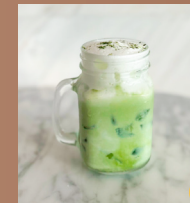
Iced Matcha Macchiato Milk and matcha มัทชะมัทคิอาโต้เย็น