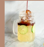
Iced Honey Lime Americano Fresh lime juice, honey and freshly brewed coffee อเมริกาโน่ปั่นมะนาวเย็น