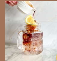
Iced Tonic Water Americano Freshly brewed coffee with tonic water โทนิคอเมริกาโน่เย็น