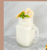
Bananawaffava Milkshake Vanilla ice cream, vanilla syrup, whipped cream, waffle, fresh banana กล้วยนมสดปั่น