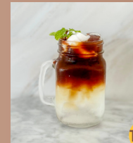
Iced Coconut Americano Fresh coconut juice and freshly brewed coffee อเมริกาโน่ปั่นมะพร้าวเย็น