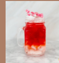
Rose Iced Tea Homemade rose flower iced tea ชากุหลาบ