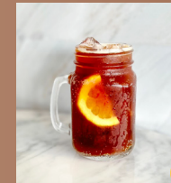
Iced Ginger Ale Americano Freshly brewed coffee with Ginger Ale จิงเจอร์แอลอเมริกาโน่เย็น