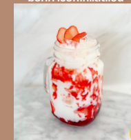
Whipped Strawberry Milk Homemade blend of strawberries and milk topped with whipped cream รวมปั่นนมสดโรยเบอร์รี่